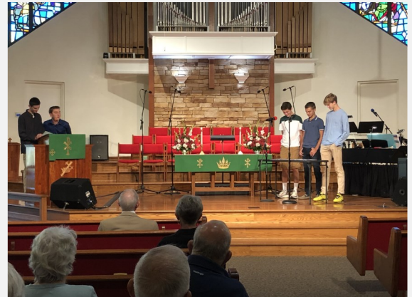
St. John Youth leading Worship a few Sundays ago.

November will be another exciting month as we have our annual lock-in on the 15 th and 16 th . The leaders ask for your prayers because we're getting older and can't pull off all-nighters like we used to. It will soon be December and we'll all be ramping up for the Christmas season. This year has flown by but one thing I know for sure, God has poured out His grace and blessings on the youth ministry at St. John.