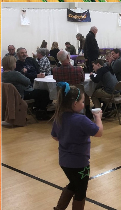
Young girl serving coffee to someone at Shrove Tuesday Pancake Dinner.