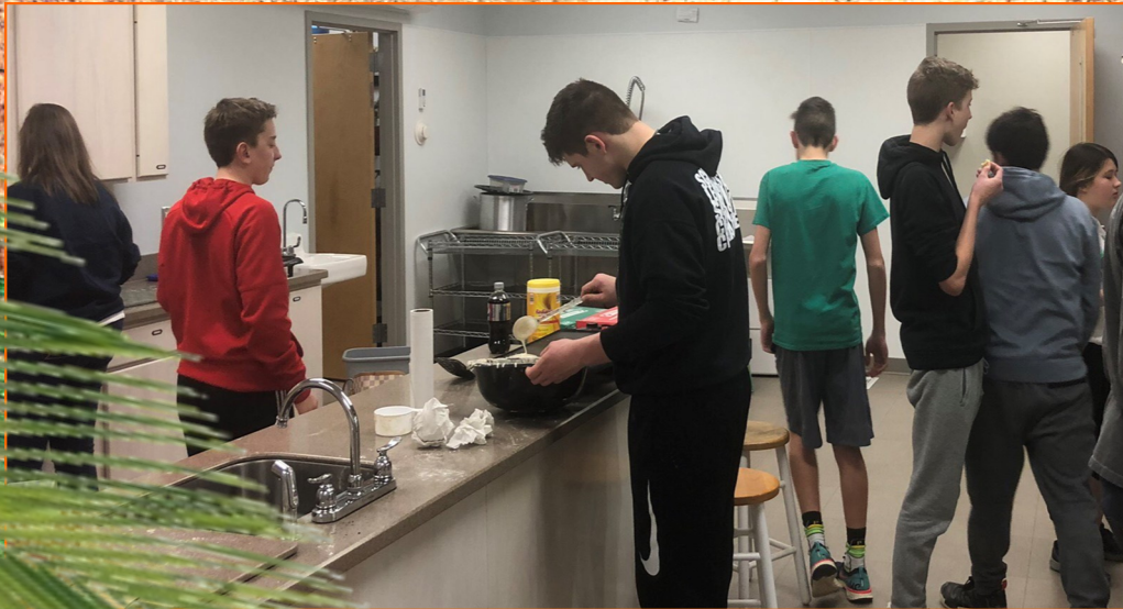
Youth making pancakes for Shrove Tuesday.